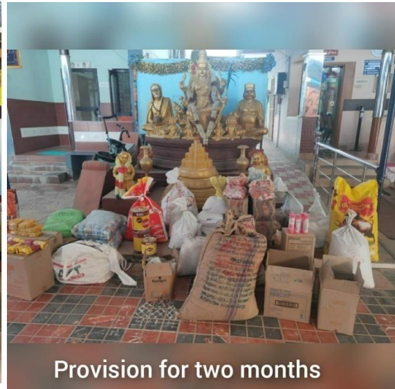
Provision for two months