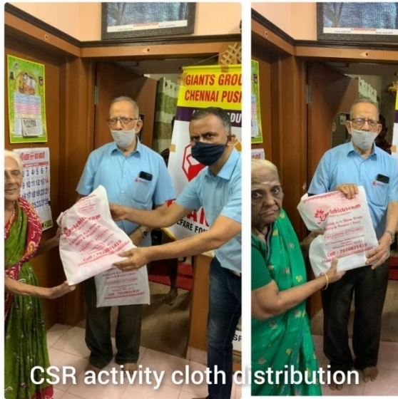
CSR activity cloth distribution