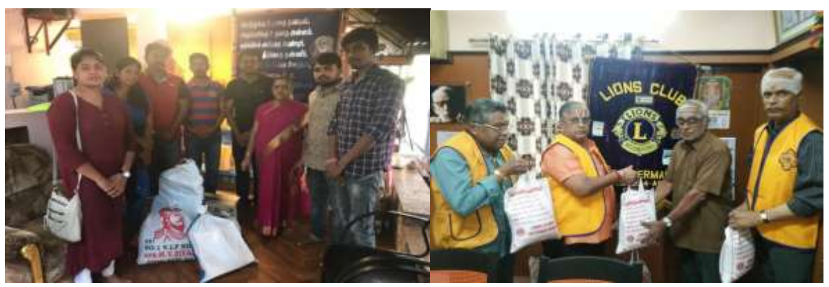
HCL Team Lions club

(b) Thiruneermalai Lions club members visited our trust and donated groceries for feeding. (8^{th} \text{ Sept '}18)