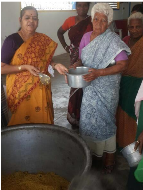
Food Distribution at a leprosy centre near Chengelpet

Every month on a specific day, our volunteers visit several Leprosy Centres in and around Chennai. We provide food and clothes to those patients. Also, during festival days such as Diwali etc. we provide food packets to the needy.