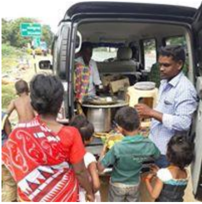
Food Distribution during Diwali

4. Vardhah Cyclone in Chennai had caused good amount of damage to our premises. There was no electricity for nearly 4-5 days (which was managed with gensets) and no internet for 10-15 days. With the help of good natured donors, specifically Sri.V.T.Panchabagesan, Chennai we managed to rebuild the infrastructure.